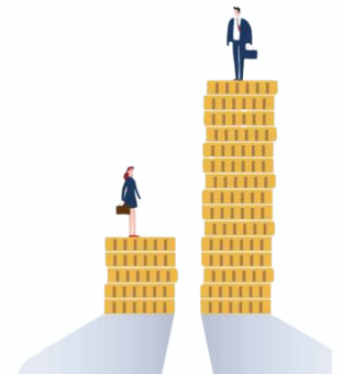
The textile sector employs more than 30% of female workforce