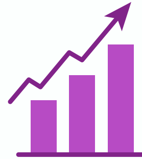
GDP of Pakistan can increase by 30% with increased female labor force participation (IMF report, 2018)

WEXNET, also known as Women Exporters Network, is the largest women-exclusive exhibition platform created in 1999 to promote female entrepreneurship in Pakistan. Over the years, it has successfully organized exhibitions and workshops/seminars in 1999, 2001, 2002, 2003, 2005, 2006, 2010, 2014, and 2015.